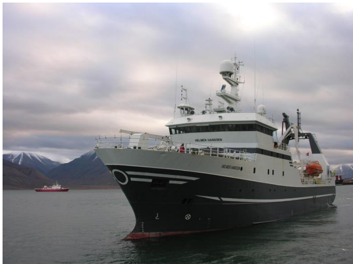
The Norwegian research vessel Helmer Hanssen leaving the quay at Longyearbyen in Svalbard

I have just returned from three weeks in Svalbard, and recorded my furthest ever north, at 81° 45'N in the Arctic Ocean north of Kvitoya - the isolated and most easterly island of the archipelago close to the marine boundary