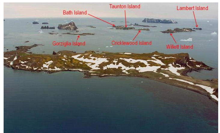
An aerial shot of the Aitcho Islands taken from one of HMS Endurance's, with pointers to the newly-named isles

The Aitcho Islands, pronounced H-O, for Hydrographic Office, are part of the British Antarctic Territory and Lambert Island, which is about 350ft long and 150ft wide at its broadest point, lies at 62° 22' 16.0" S, 59° 45' 49.0" W.