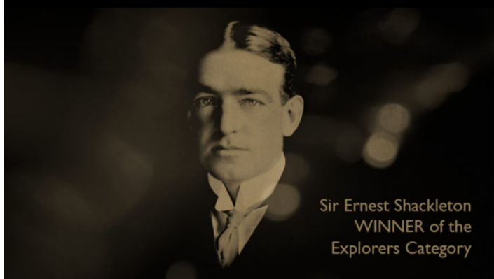
Sir Ernest Shackleton WINNER of the Explorers Category

Watch the Grand Live Final 5th February 2019 BBC 2 at 9.00pm