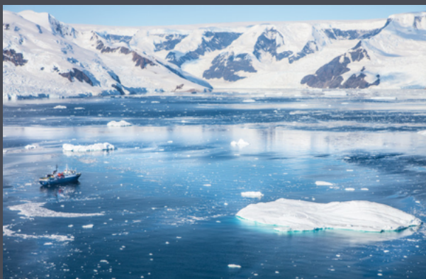
Antarctic cruise -