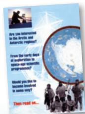
Our previous leaflet design