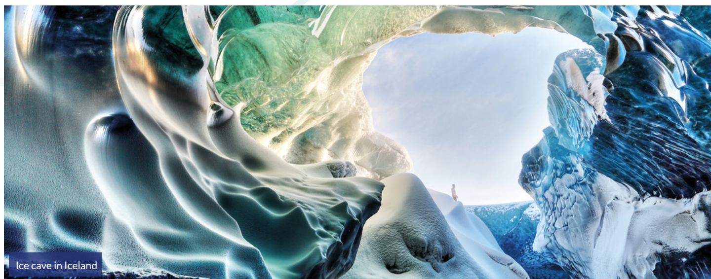
Ice cave in Iceland