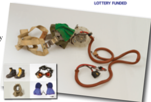
Antarctic objects from the Polar Museum collection, including a face mask and flowmeter for an Integrating Motor Pneumotachograph.

Perhaps the most bizarre item we encountered is the 'IMP' or 'Integrating Motor Pneumotachograph', a piece of equipment designed to measure energy expenditure and used on the Commonwealth Trans-Antarctic Expedition of 1955-58. According to