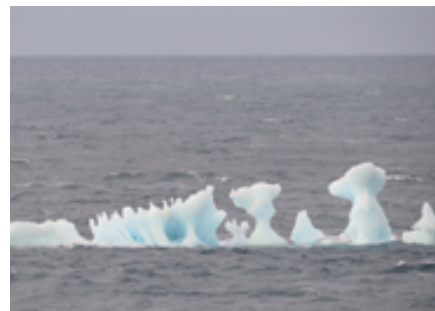
An iceberg, but no sea ice, in the summertime Barents Sea

Our research area was close to the marine border between Norway and Russia in the Barents Sea. We were sailing between the islands of Nordaustlandet and Kong Karls Land. This is an isolated part of the world, to which few ships go, and Kong Karls Land is seldom visited. Whales and walrus were sighted along with icebergs calved from an ongoing surge, or rapid advance, of part of the huge Austfonna ice cap on Nordaustlandet – the largest ice cap in the Eurasian Arctic.