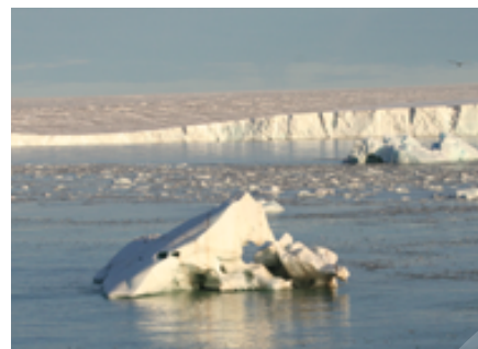
Icebergs and the ice cap of Austfonna in eastern Svalbard.

The Masters programme we have built up at the Institute, our MPhil. in Polar Studies, is an important part of the wider research activity of the SPRI. This is because many of our graduate students produce work, often based on polar datasets that we have collected from field visits to the Arctic and