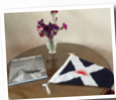
The coffee table

As a longstanding Friend, it was always my ambition to visit Antarctica and particularly the places associated with Sir Ernest. The pressures of children, jobs, mortgages and more always meant putting this off but when The Shackleton Centenary Voyage first appeared in Polar Bytes, early in 2013, my immediate thoughts were, "it has to be this one".