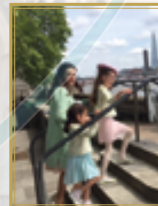
Above and right: Friends arriving onboard the HMS Wellington