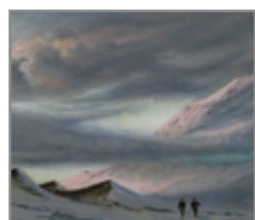
Painted during Terra Nova expedition 2.4.1911.

This August a landmark exhibition will bring together the beautiful work of Herbert Ponting and Edward Wilson for the first time.