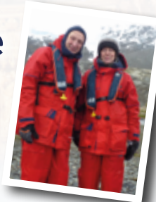
Fulfilling my dream

Not quite, at the end of last summer, a boatbuilder's specification sheet mysteriously appeared on the same coffee table and to my utter amazement, we collected our new boat early in March! At least the magic coffee table has some uses, coffee is never drunk in this Yorkshire home!