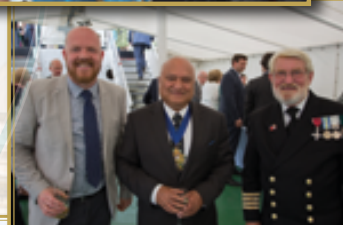
Above: Friends onboard