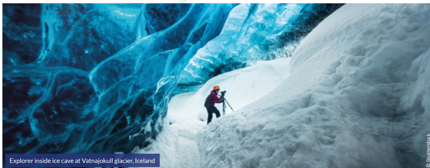
Explorer inside ice cave at Vatnajökull glacier, Iceland