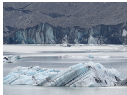
Icebergs calve regularly from the terminus of New Zealand's Tasman Glacier into the adjacent lake.

First, I shall be working northeast of the archipelago with the aim of reconstructing the pattern of past ice flow from the ice sheet that covered Svalbard and the Barents Sea 18,000 years ago. A second project will investigate the detailed geometry of three large glacial river deltas at the heads of fjords close to Longyearbyen, and the processes that operate on them.