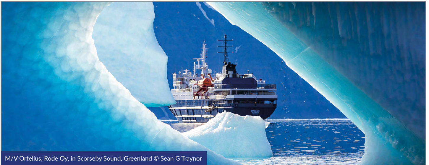
M/V Ortelius, Rode Oy, in Scorseby Sound, Greenland