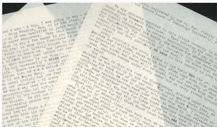
Prime Minister Baldwin's 1934 address

It seems fitting in this SPRI's centenary year that a little piece of our history has come back to us. Covid restrictions on travel prevented it being delivered until this week. The latest accession into the archive is a three-page typescript of the address given by Prime Minister Stanley Baldwin at the Senate House of Cambridge University on 16 November 1934 regarding the official opening of our SPRI building on Lensfield Road. Sent from New Zealand by long time researcher David Harrowfield the text has now returned to the very building Baldwin was opening.