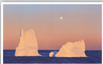
Icebergs and Moon, Ilulissat, 2019